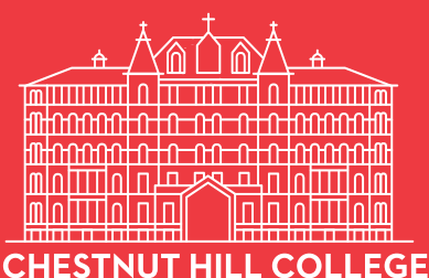
CHESTNUT HILL COLLEGE

small town charm + big city opportunities.