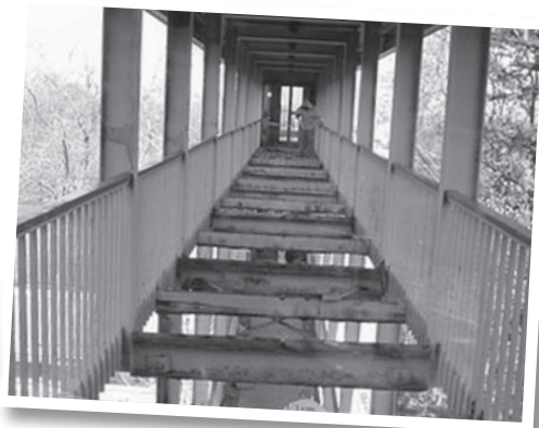
Repairs to bridge connecting to Lodge