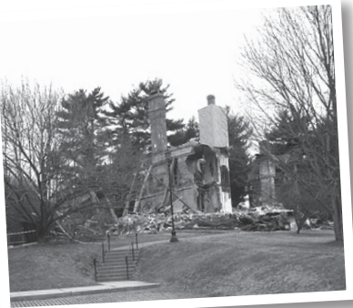
Demolition of Wyncliffe