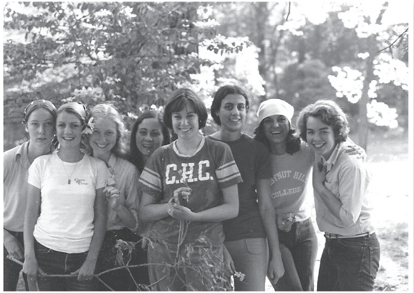
Pastorius Park, 1976

Moving into Division II athletics and our new logo will bring attention to our college and play a vital part in recruiting new students. As alumni, we too can help. Word-of-mouth marketing is one the most effective methods of marketing, and it costs nothing! Just talk about the College. We all have special memories and moments from Chestnut Hill. Why not share them more often. All my friends know exactly where I went to college. Do I know where they went? For the most part, no, except for the one Ohio State alum who gets football tickets! I can work a story about Chestnut Hill into almost any conversation these days! By talking about our college we can all serve an important role as effective alumni recruiters.