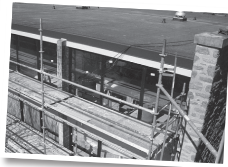
New roof and windows for Lodge

The ongoing development of SugarLoaf Hill progressed steadily this spring with the demolition of the three unusable structures on the property. Wyncliffe, the 1875 mansion that was irreparably damaged by fire a few years ago, was finally dismantled in late March. Also razed was the greenhouse and so-called “hippie house” which perched on the hill along the west side of Germantown Avenue. Clean-up and grading of the property in the aftermath will complete this phase of the project.