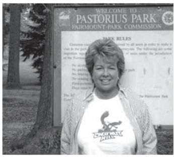
Sporting new athletics logo, 2008

As I sit down to write my final column of my term as alumni association president, appropriately it was at this same time in 1976 when my days as a Chestnut Hill student were coming to an end. I am, of course, writing this on deadline day, which reflects how I approached my academic career. I remember my final days as a Chestnut Hill student only too well. I had saved my final religion credits for my second semester of senior year, and, the truth be told, I wasn't doing too well in that class. I was told I was in danger of not graduating, and the Sisters all but confined me to my room in Fournier Hall with a patient religion tutor. What a way to spend my final few days on campus.