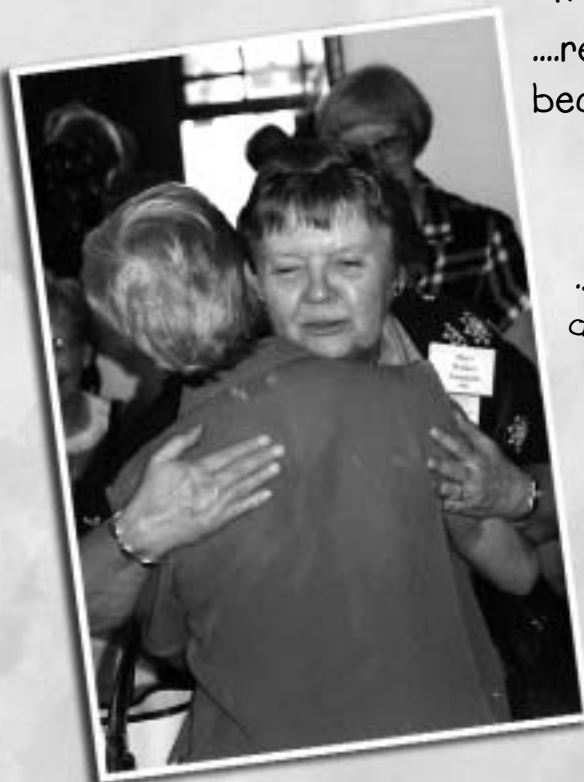
It's wonderful to reconnect with old friends!