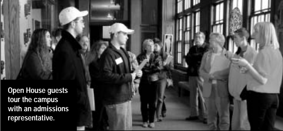
Open House guests tour the campus with an admissions representative.

The pace is brisk and the anticipation is palpable as CHC continues to make the transition to coeducation in the traditional college. Concerted efforts by the administration, faculty and staff are all working together to ensure the vibrancy of this college of distinction.