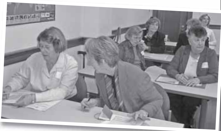
One of four mission-promoting workshops that followed the keynote address.