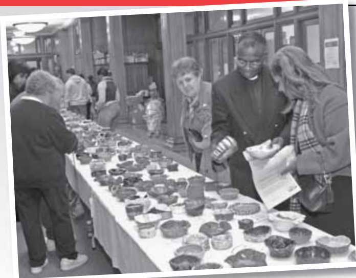
A banquet table of empty bowls stretched down the Music Corridor on the night of the Empty Bowl Dinner, ready to be selected by discriminating diners and filled with hot soup donated by dozens of local restaurants and caterers.

For the complete winter/spring sports schedule, check the College's Web site at www.edu/athletics and plan to support our teams at an away game near you!